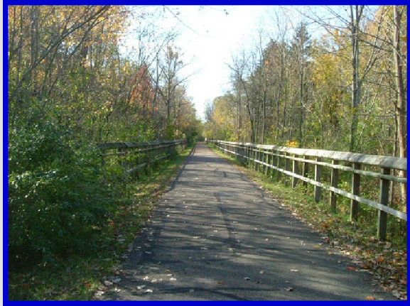
North Coast Inland Trail