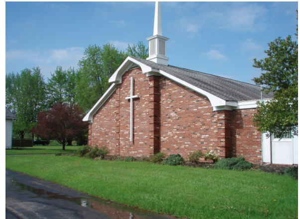
Developed in partnership with: